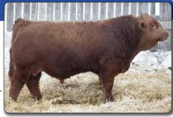
Consigned by: Four D Ranch Ltd.

Heifer Approved These Bravodo calves are awesome, small framed, very aggressive at birth and don't stop growing. Here is your next money maker herd bull. Thanks Dan for suggesting we purchase this new herd bull from you. CE: 10.2 BW: 1.7 WW: 75.8 YW: 111.5 MCE: 10.7 MWWT: 57.3 Milk: 19.5