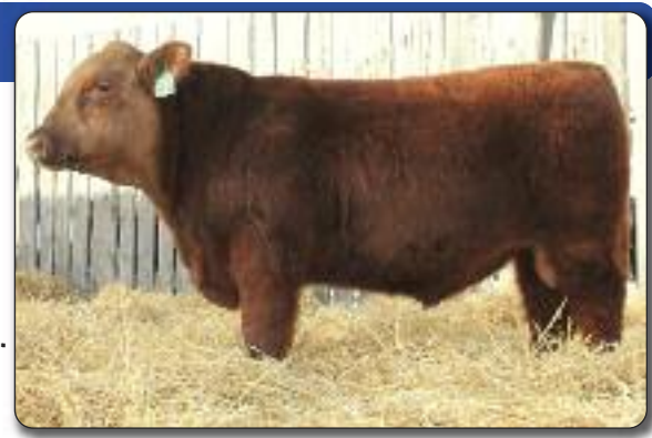
Consigned by: Mann Bros. Red Angus