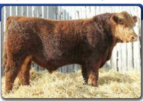
Consigned by: Mann Bros. Red Angus NORTHWEST'S BULL SALE