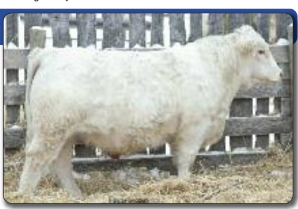
Consigned by: Swistun Charolais

Double vaccinated with Fusogard for footrot. BW: -4.2 WW: 34 YW: 66 Milk: 20.7 TM: 38