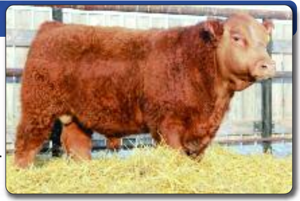
Consigned by: Double R Simmentals

CE: 12.2 BW: 0.7 WW: 65.7 YW: 96.1 MCE: 6.1 MWWT: 54.5 Milk: 21.8