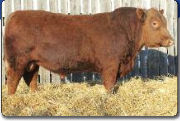
Consigned by: Mann Bros. Red Angus