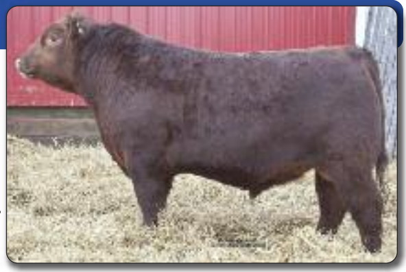
Consigned by: High Tree Cattle

BW: -1.2 WW: 45 YW: 63 Milk: 10 TM: 33 CE: 4.6 MCE: 11.1