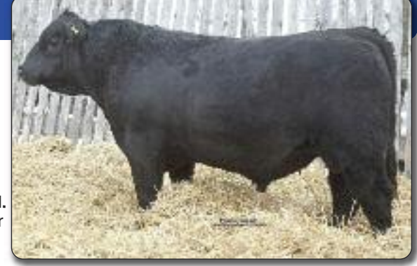
Consigned by: High Tree Cattle

BW: 2.5 WW: 49 YW: 86 Milk: 27 TM: 52 CE: 4.0 MCE: 6.0