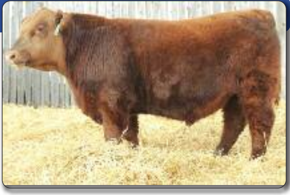
Consigned by: Mann Bros. Red Angus