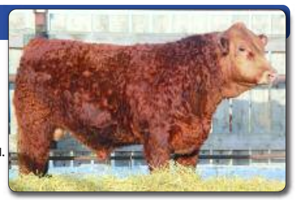
Consigned by: Double R Simmentals

CE: 4.1 BW: 2.3 WW: 67.9 YW: 89.8 MCE: 10.5 MWWT: 53.7 Milk: 19.9