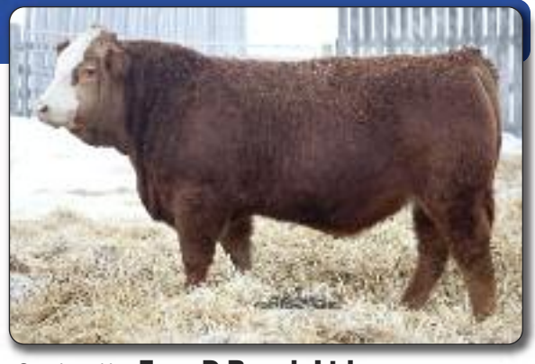
Consigned by: Four D Ranch Ltd.

CE: 2.8 BW: 4.9 WW: 70.6 YW: 106.7 MCE: 4.6 MWWT: 64.4 Milk: 29.2