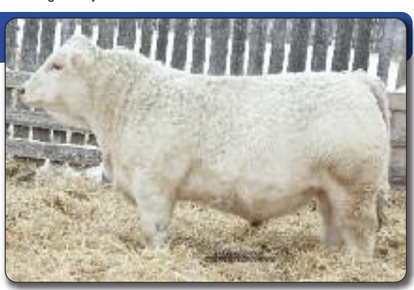
Consigned by: Swistun Charolais

BW: -3.6 WW: 48 YW: 93 Milk: 23.0 TM: 47