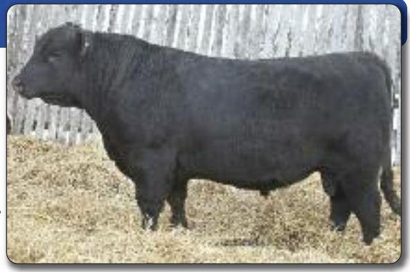
Consigned by: High Tree Cattle

BW: 3.0 WW: 57 YW: 99 Milk: 17 TM: 46 CE: 2.0 MCE: 9.5