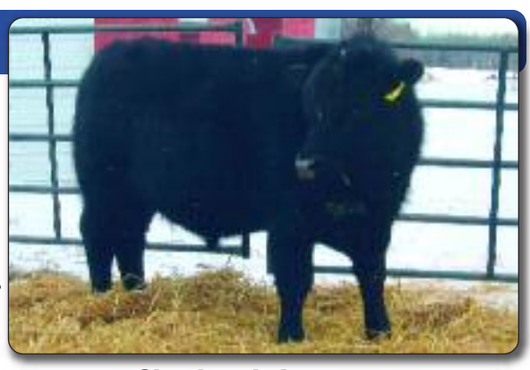
Consigned by: Skyebrook Angus

BW: 2.8 WW: 28 YW: 69 Milk: 10 TM: 24 CE: -3.5 MCE: 0