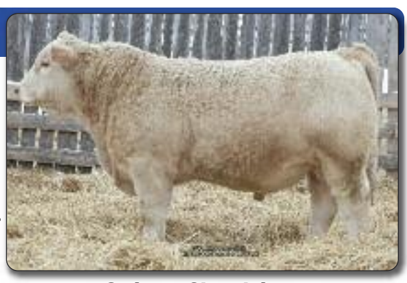
Consigned by: Swistun Charolais

Double vaccinated with Fusogard for footrot. BW: 0.6 WW: 38 YW: 74 Milk: 26.6 TM: 46