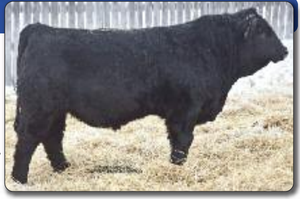
Consigned by: Four D Ranch Ltd.

CE: 5.7 BW: 3.9 WW: 88.2 YW: 135.8 MCE: 11.0 MWWT: 62.8 Milk: 18.8