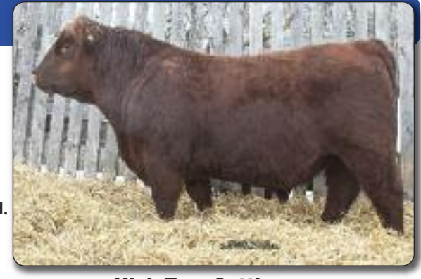
Consigned by: High Tree Cattle

BW: 0.1 WW: 43 YW: 68 Milk: 26 TM: 41 CE: 0.4 MCE: 3.8