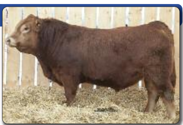
Consigned by: Lazy A Limousin

This bull has a wide back and shoulder packed with muscle. He is a traveller with good scrotal and high docility. An easy bull to handle. Gest: -1.4 CED: 2.5 BW: 4.0 WW: 65.2 YW: 92.5 Milk: 28.0 SC: 0.2 DOC: 13.0