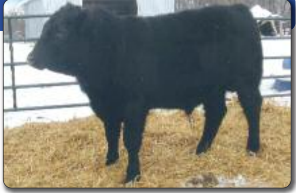
Consigned by: Skyebrook Angus

BW: 3.6 WW: 34 YW: 64 Milk: 11 TM: 28 CE: -6.0 MCE: -2.0