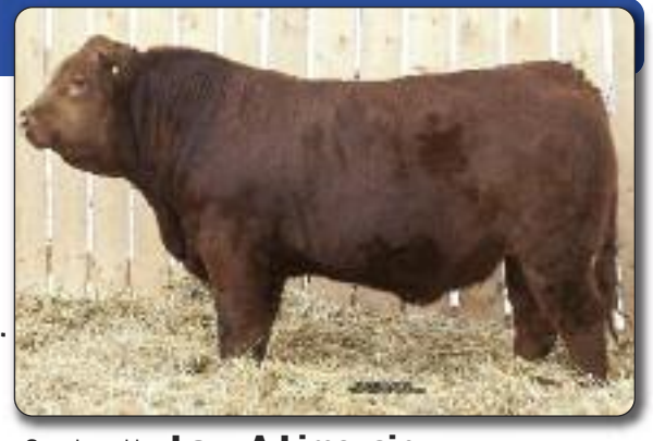
Consigned by: Lazy A Limousin

Gest: -2.0 CED: 2.4 BW: 3.7 WW: 65.0 YW: 87.0 Milk: 28.1 SC: 0.0 DOC: 13.8