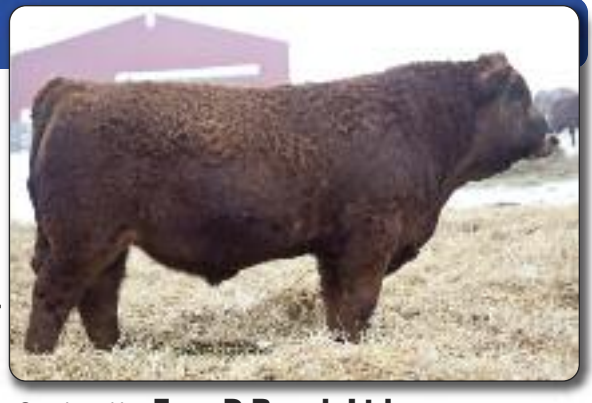
Consigned by: Four D Ranch Ltd.

CE: 2.6 BW: 4.9 WW: 85.7 YW: 121.6 MCE: 12.0 MWWT: 56.5 Milk: 13.7