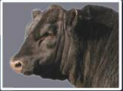
Black Angus Bulls