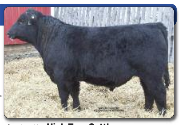
Consigned by: High Tree Cattle

BW: 4.7 WW: 58 YW: 95 Milk: 19 TM: 48 CE: -1.0 MCE: 10.0