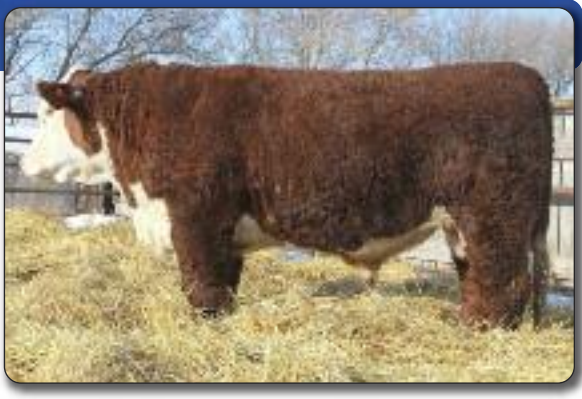
Consigned by: R&L Heather Polled Herefords

R&L 31X ATLAS 21A is a complete bull with plenty of length and depth. He is out of a well uddered, easy keeping cow. This bull would make an excellent addition to any herd.