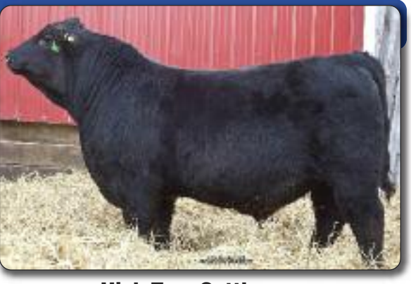
Consigned by: High Tree Cattle

BW: 2.5 WW: 61 YW: 98 Milk: 29 TM: 60 CE: 6.0 MCE: 11.0