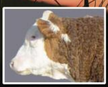
Polled Hereford Bulls