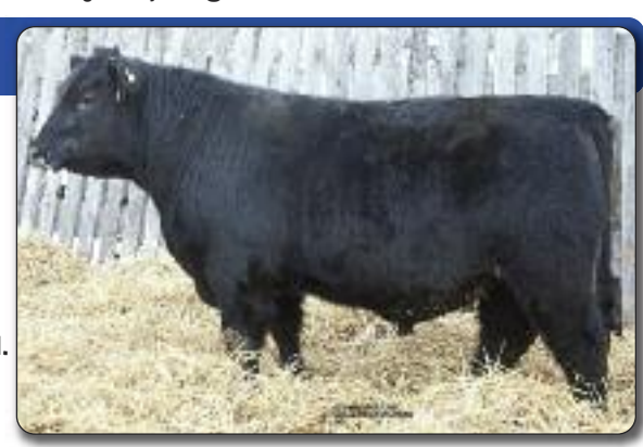
Consigned by: High Tree Cattle

BW: 2.9 WW: 65 YW: 108 Milk: 30 TM: 63 CE: 4.0 MCE: 7.0