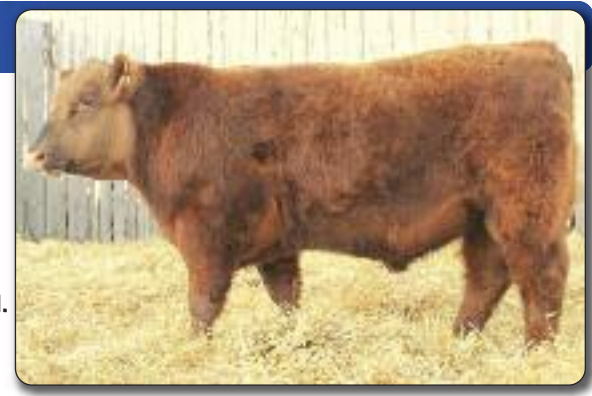
Consigned by: Mann Bros. Red Angus

RED LETTER ICON 1R RED PASQUIA ICON 34T RED PASQUIA FAYET 22L