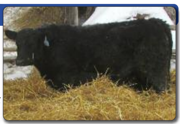
Consigned by: Tall Tree Angus

Here is a heifer's first calf that is very well balanced and should catch your eye.