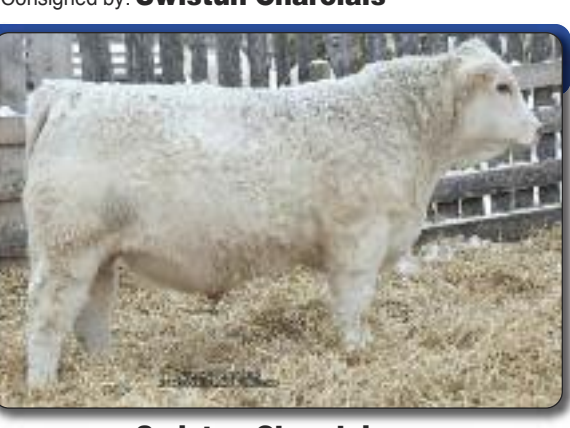
Consigned by: Swistun Charolais

Double vaccinated with Fusogard for footrot. BW: -0.8 WW: 30 YW: 62 Milk: 23.7 TM: 39