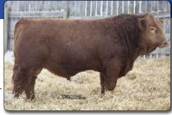
Consigned by: Four D Ranch Ltd.

CE: 3.2 BW: 5.3 WW: 82.0 YW: 127.3 MCE: 10.5 MWWT: 65.1 Milk: 24.2