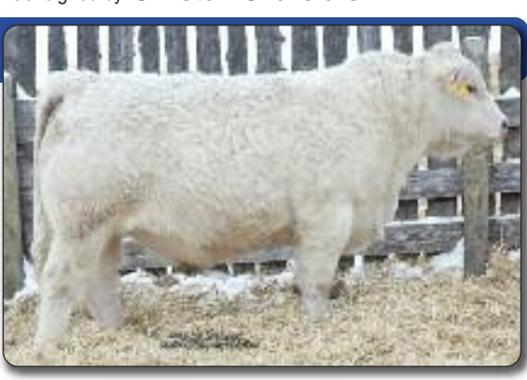
Consigned by: Swistun Charolais

Double vaccinated with Fusogard for footrot. BW: -1.3 WW: 38 YW: 74 Milk: 13.2 TM: 32