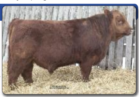
Consigned by: High Tree Cattle

BW: 1.7 WW: 55 YW: 94 Milk: 14 TM: 42 CE: 7.9 MCE: 9.2