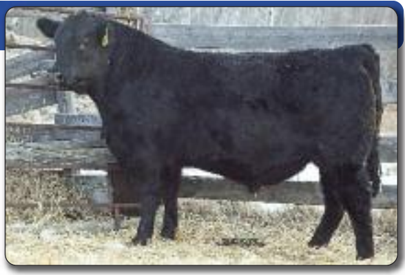
Consigned by: Triple T Farm