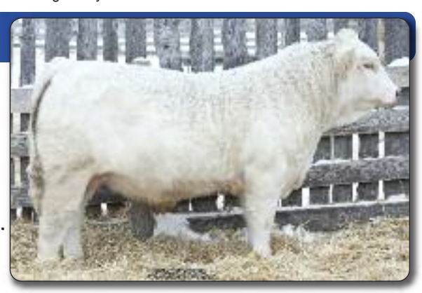
Consigned by: Swistun Charolais

Double vaccinated with Fusogard for footrot. BW: 1.6 WW: 44 YW: 79 Milk: 24.5 TM: 47