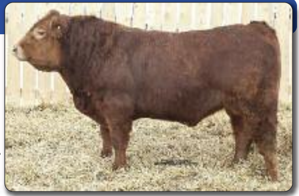
Consigned by: Lazy A Limousin

This evenly proportioned bull has amazing length of spine and a flat top line. He is very quiet and easy to work with. His milk EPDs of 30.6 are reflective of his dam, who has the highest milk EPDs in our herd. Gest: -1.2 CED: 2.2 BW: 3.5 WW: 65.9 YW: 90.8 Milk: 30.6 SC: 0.0 DOC: 6.7