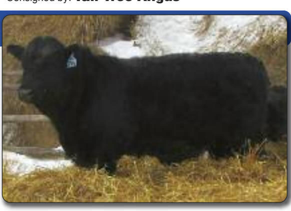
Consigned by: Tall Tree Angus

Here is a young bull with lots of frame and length of spine.