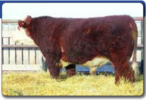
Consigned by: R&L Heather Polled Herefords

R&L 10U AVATAR 43A is a dark red bull with goggle eyes. He is very thick and well muscled. The dam, a daughter of Beyond, is an excellent producing cow raised on the Heather farm.