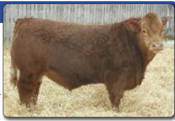
Consigned by: Four D Ranch Ltd.

Heifer Approved There is nothing else to say about our Nikon bulls that you haven't seen in the past years. They get everything honestly, right from the sire to the dam. Unfortunately, this is the last string of Nikon calves to sell. Don't miss out. CE: 9.4 BW: 1.7 WW: 59.8 YW: 92.7 MCE: 11.8 MWWT: 48.5 Milk: 18.7