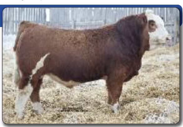
Consigned by: Four D Ranch Ltd.

CE: 12.0 BW: 1.9 WW: 71.0 YW: 103.1 MCE: 13.2 MWWT: 60.6 Milk: 25.2