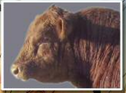
Red Angus Bulls

For every $300 you spend on a bull receive ONE CHANCE to WIN