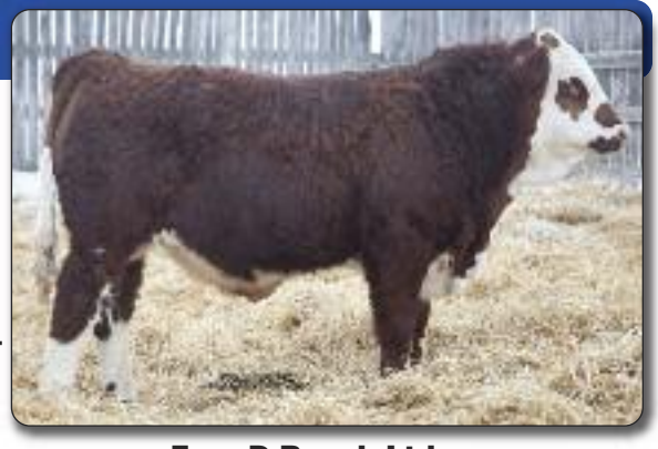
Consigned by: Four D Ranch Ltd.

ČE: 3.3 BW: 4.7 WW: 65.1 YW: 86.1 MCE: 11.5 MWWT: 62.6 Milk: 30.1