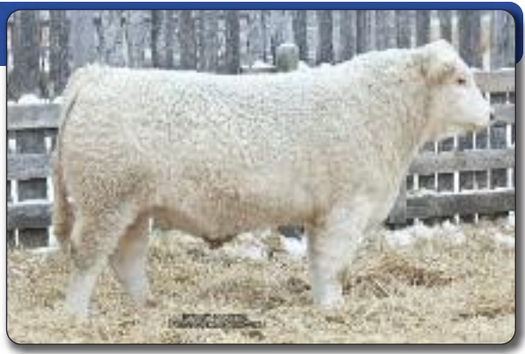
Consigned by: Swistun Charolais

BW: -2.5 WW: 43 YW: 80 Milk: 24.1 TM: 45