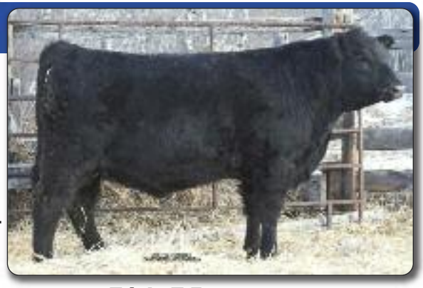
Consigned by: Triple T Farm