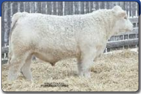
Consigned by: Swistun Charolais