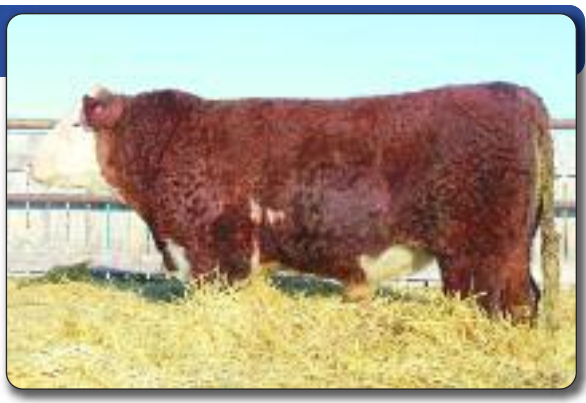
Consigned by: R&L Heather Polled Herefords

R&L 46W AVENGER 95A is a red-neck bull with a moderate frame. This smooth, well muscled bull should be an easy calving bull that will make a good herd sire.