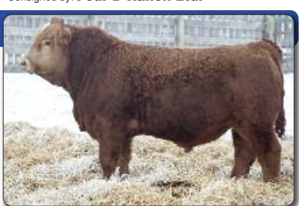
Consigned by: Four D Ranch Ltd.

CE: 5.8 BW: 4.4 WW: 77.5 YW: 115.0 MCE: 11.1 MWWT: 57.0 Milk: 18.4