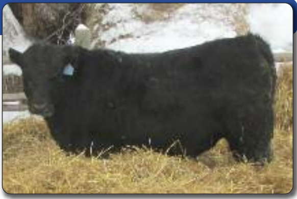
Consigned by: Tall Tree Angus

This son of Royal Net Worth is a powerful individual that should fit into any breeding program.